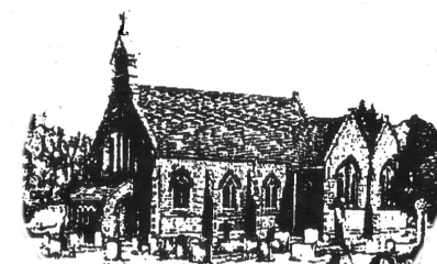
St John, Littlewick Green