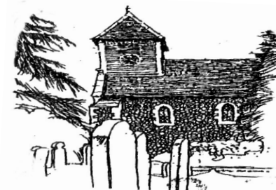
St Mary the Virgin, Hurley